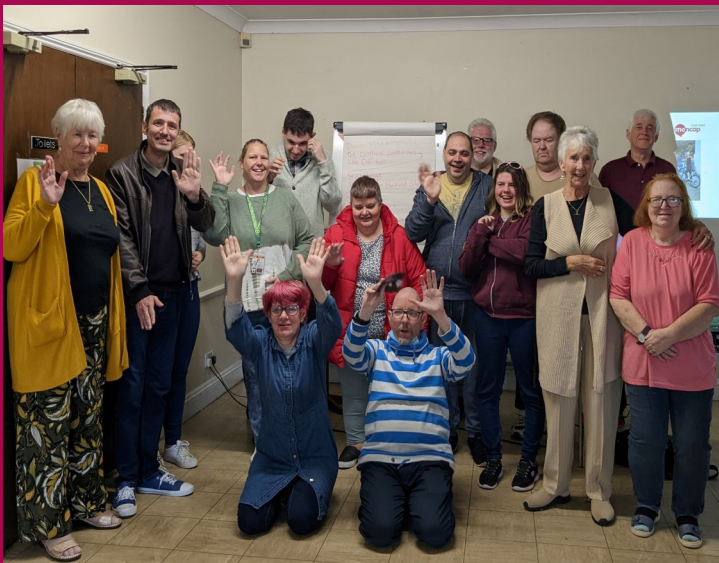
Celebrations at Ashford Mencap