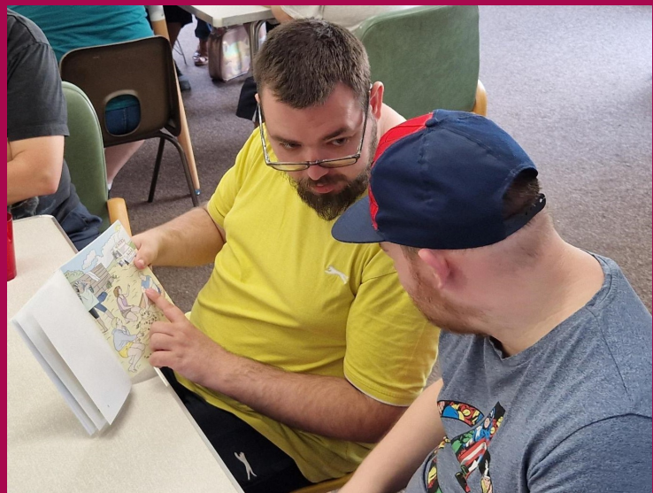
Books Beyond Words Pop-Up