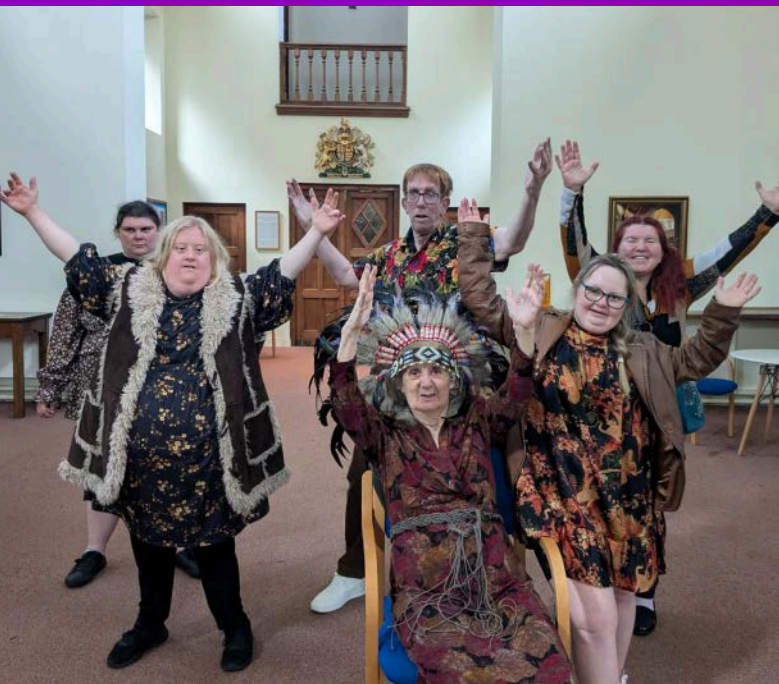
Fashion show success