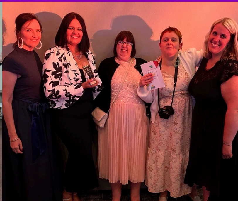
Award winning team