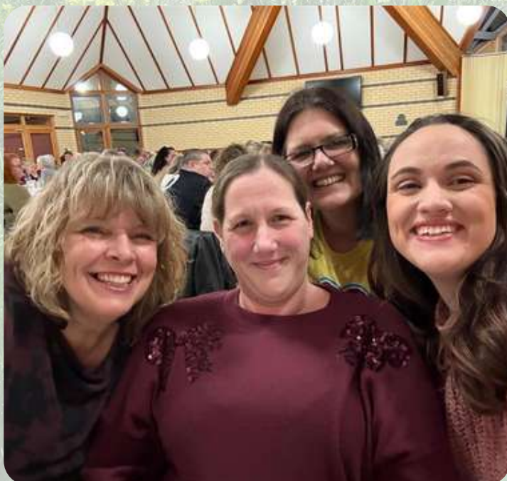
Quiz Night Fun